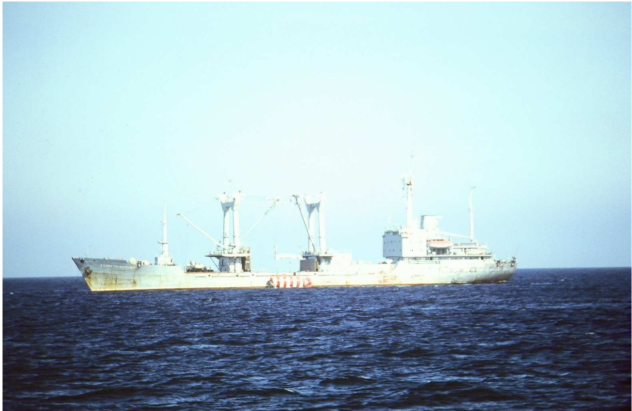
The Georgi Kozmin

had also been hastily flown, this time from Crimean Sevastopol on the Black Sea shores of the Ukraine. And he knew of the Georgi Kozmin with its two manned and two unmanned submersibles. He did not know that the Georgi Kozmin divers had come from Soviet Gavan, the main naval port across the Tatar Straits from Sakhalin and that all these divers were naval, working separately, and, for the most part, prior to the two civilian groups. Had he known, he might well have pondered the reason for the separation in time and place between the military and civilian divers. He might have pondered the natures of their respective operations.