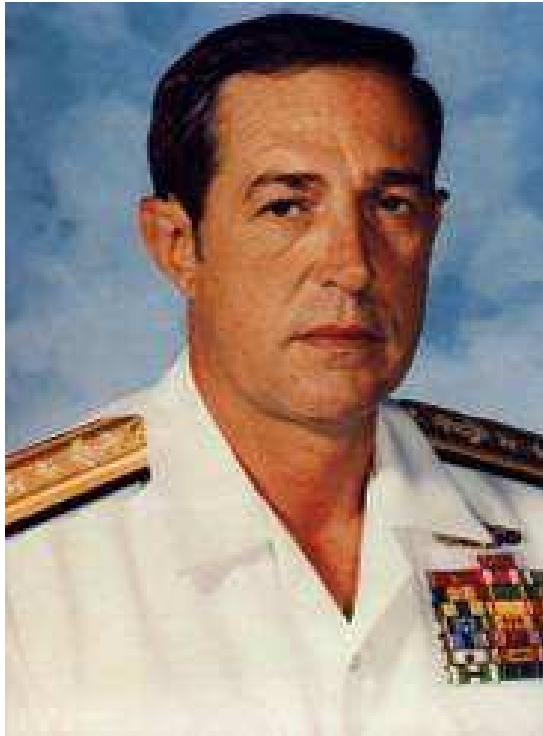
Rear Admiral Walter T. Piotti

The new commander of U.S. Seventh Fleet Task Force 71 stood on the bridge staring deeply into the dark in the direction of Moneron Island. Today, Rear Admiral William Cockell had been relieved of command of the Task Force and its Search and Rescue mission, now reclassified (as of September 10 th ) as Search and Salvage – all hope for survivors from Korean Air Lines Flight 007 was gone. He, Rear Admiral Walter T. Piotti, Jr., was now in command.