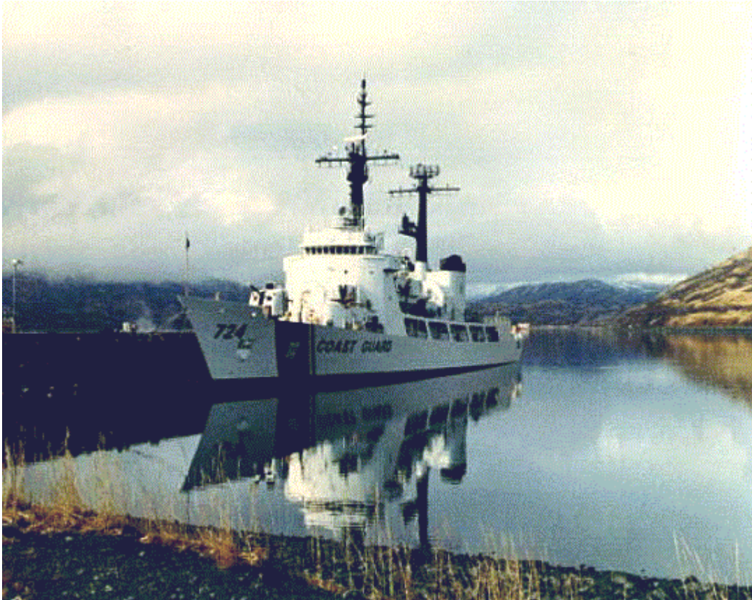
USCG Cutter Monro

On the U.S. side, as far as the SAS vessels were concerned, there were three U.S. ships – the Coast Guard cutter Monro , the rescue salvage ship USS Conserver , and the Fleet Tug USNS Narrangansett . There were also three Japanese tugs chartered through the U.S. Navy’s Far East Salvage Contractor (Selco) – the Ocean Bull , the Kaiko-Maru 7 , and the ill-fated Kaiko-Maru 3 .