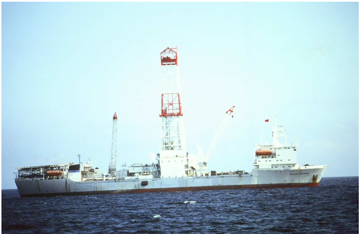
The Mikhail Merchink

There, beyond Commander Piotti's vision, but in the direction of Moneron, was the main Soviet salvage ship, the Mikhail Mirchink . Designated an S.P.D., Self Propelled Drill ship, the Mirchink was a Swedish built vessel having the great advantage of being able, thanks to its gyros, to stabilize itself dynamically over one spot, regardless of wind or waves.