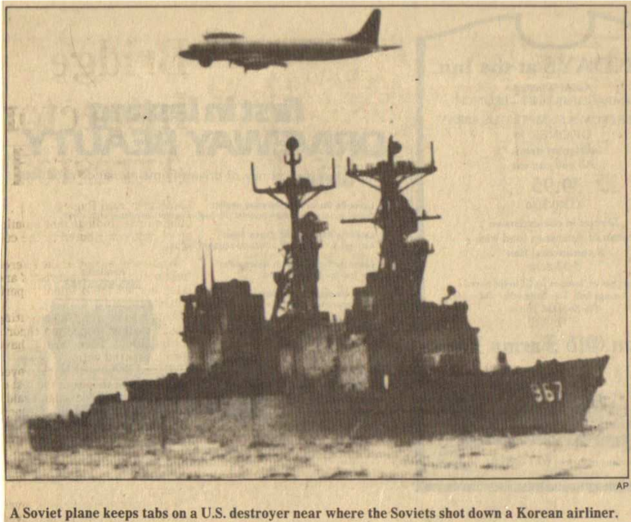
The destroyer in the above photo is the USS Elliott DD967

But things had been taking a turn for the worse. Confrontations had occurred, threats had turned to deeds, weapons had been pointed and locked on, the nuclear specter had loomed becoming a distinct possibility – all over KAL 007's wreckage and its "Black Boxes"!